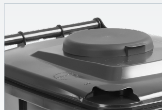
Round slot with rubber rosette and lid