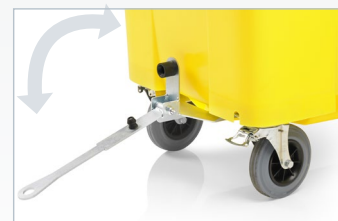
Optional Towing Kit