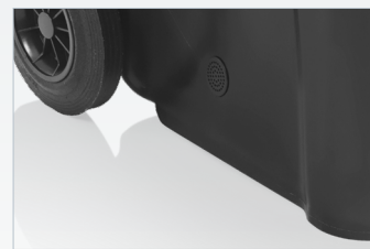
Ventilation openings on both sides of the body