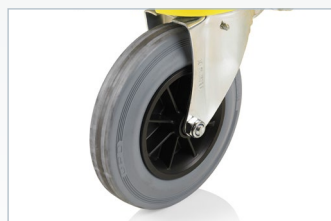
Non marking wheels